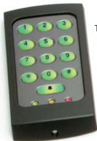
TOUCHLOCK K series keypads

Our new range of Net2 readers, keypads and exit buttons are available now. Great performance combined with stylish looks: