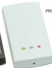
PROXIMITY P series readers