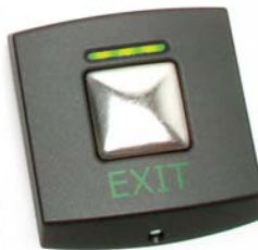
E series exit buttons