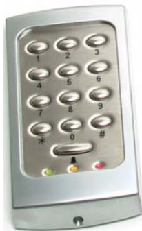
TOUCHLOCK K series stainless steel keypads